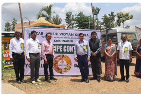
Dignitaries at the millet recipe programme