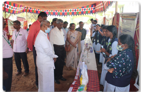
Organic Products and Millets Food Products by KVK Krishnagiri