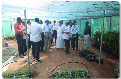
Nursery Visit by Officials