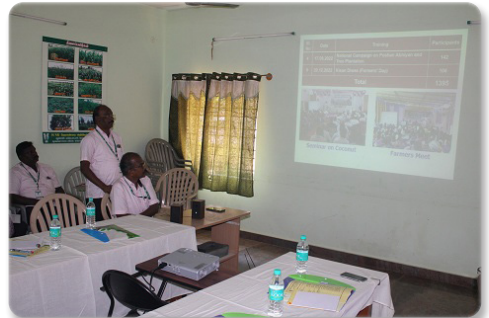
15th SAC Presentation by SS & Head