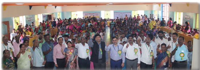
Mass oath on Millet nutrition