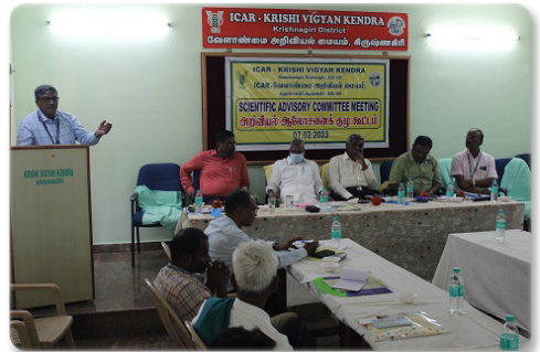
Recommendation by Principal Scientist, ATARI, Zone – X, Hyderabad