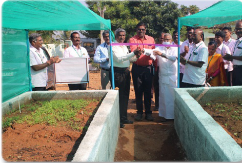
Establishment of New Demo Unit - Agroforestry Germination Bed