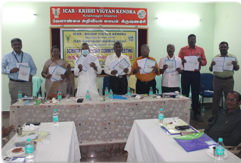
Release of Natural Farming Leaflet