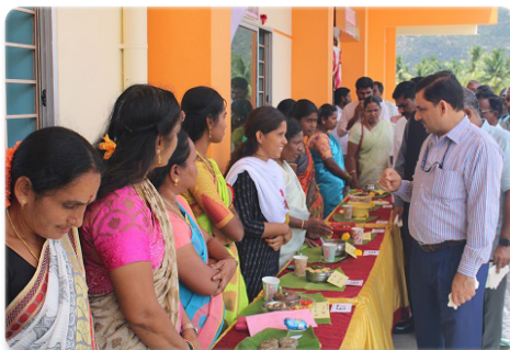
Discussion with contestant on millet and herbal blended recipes