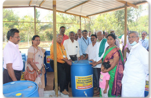
Establishment of New Demo Unit - Natural Farming Demonstration