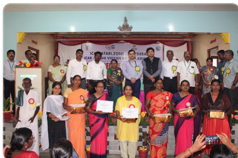
Group photographs of millet recipe contest winners