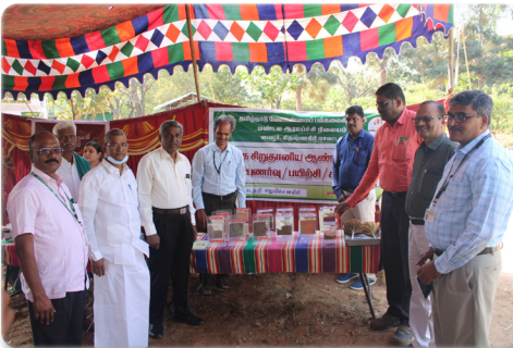
Exhibited by RRS Paiyur (TNAU), Krishnagiri