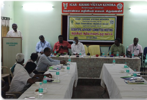
Recommendation by Director of Extension Education, TNAU, Coimbatore